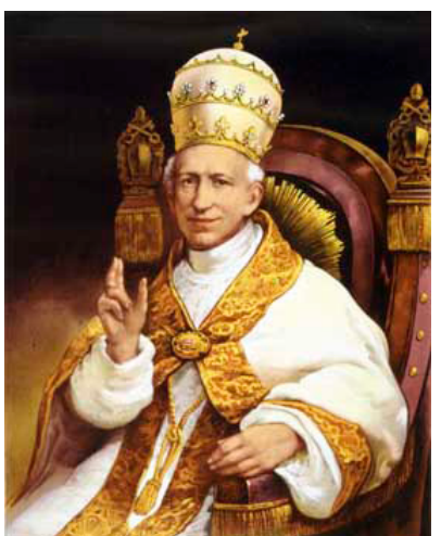
Pope Leo XIII

Less well-known is his encyclical Arcanum Divinae Sapientiae. Issued in 1880 it was